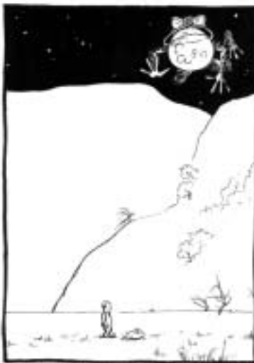
"DID I EVER TELL YOU ABOUT THE FROG-PONY?"