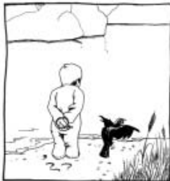
"IT WAS RIGHT HERE WHEN I LEFT IT..."